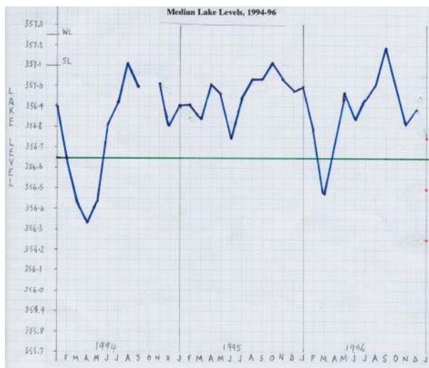
Figure 2: A display of median lake levels each month in the period January 1994 to December 1996 (NIWA data).