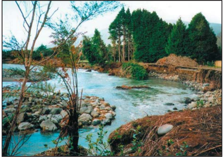
10. Damage as the result of poor maintenance of flood protection structures.

In 1998, some 10,000 cubic metres of soil were washed away at the end of Kutai Street. The gabions placed at this point of the river by the Ministry of Works in 1964 were not maintained.